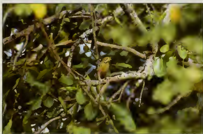
Figure 1. Male Ortolan Bunting Emberiza hortulana , Amurum Forest Reserve, Nigeria, 14 November 2003 (Ross McGregor)

The species appears to be genuinely rare in Nigeria and the records reported above were probably only made due to long periods of intensive